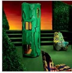
T Magazine: Design Issue, Spring 2010