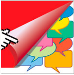
News Sites Rethink Anonymous Commenters