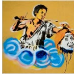
Artists Embellish Walls With Political Visions