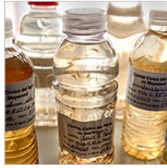
Room for Debate: Paying for Clean Tap Water