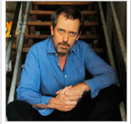
The Doctor Is In (the Director's Chair)

Differential calculus can show you the best path from A to B, and Michael Jordan's dunks can help explain why that is.